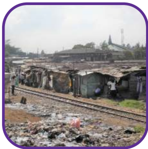
The Kibera Slum, Outside FAFU